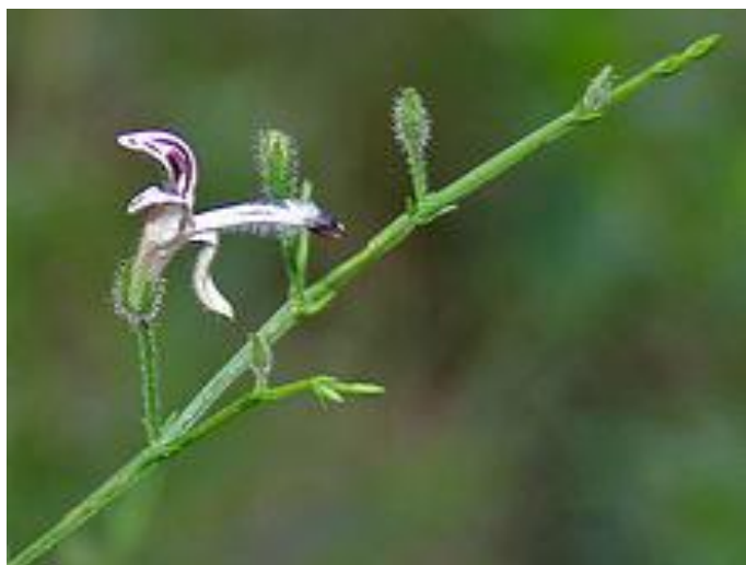
Fig. 1: Andrographis paniculata plant

Chemical Structure- Andrographolide is a major bioactive phytoconstituent which has been found in various parts of A. paniculata , mainly in the leaves. The chemical name of andrographolide is 3 \alpha , 14, 15, 18-tetrahydroxy-5 \beta , 9 \beta H, 10 \alpha -labda-8, 12-dien-16-oic acid \gamma -lactone and its molecular formula and weight are C 20 H 30 O 5 and 350.4 (C 68.54%, H 8.63%, and O 22.83%), respectively. The structure of andrographolide has been analyzed by using X-ray, 1H, 13 C-NMR, and ESI-MS [5-9]. Although andrographolide is not very soluble in water, it is soluble in acetone, chloroform, ether, and hot ethanol. It has been reported that the crystalline andrographolide was highly stable over a period of three months. It has been reported that a simple and rapid method was used for the isolating andrographolide from the leaf of A. paniculata [10].