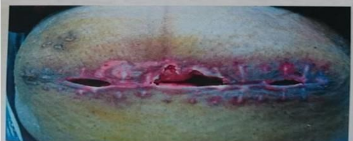
Fig. 3: Surgical site infection following huge incisional hernia mesh repair