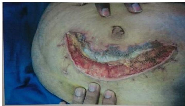
Fig. 2: Mazhar Husain 1 , Devendra Sonkar 2 , Vipul Kumar Srivastava 3 , Areena Hoda Siddiqui 3*

Infections are more in drained wounds and in the procedure involving implanting prosthesis like mesh. This increased incidence may be due to the effect of the drain itself by acting as a microbial pathway. Implants carry higher risk of infections acting as a foreign body if in case there is breach in the strict aseptic protocols.