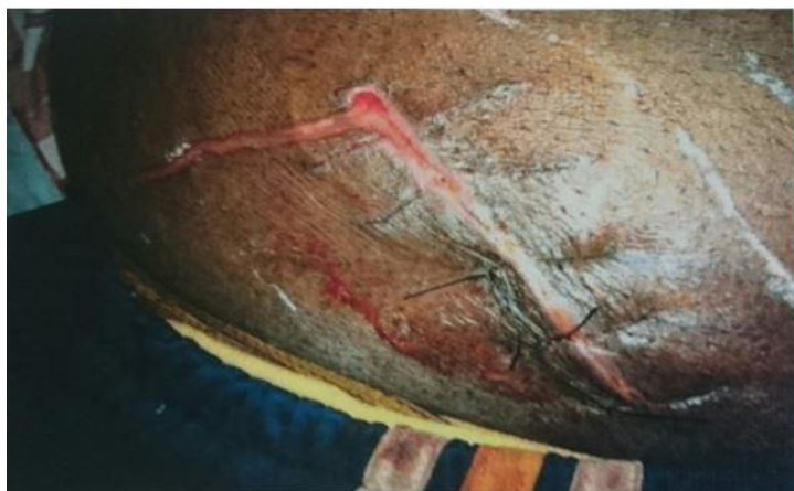
Fig. 1: Surgical site infection in Open appendectomy