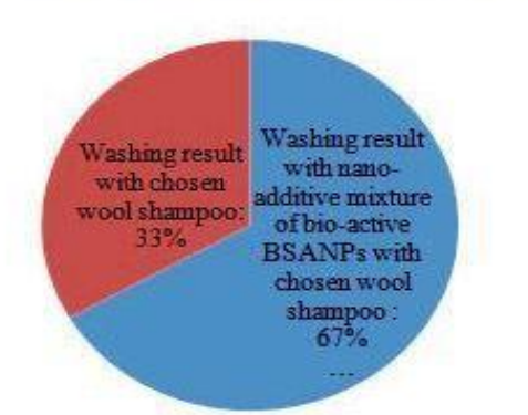
Fig. 4: Observed combined interpretations of comparative washing efficacy of chosen woolen shampoo named, Wool

& Cashmere Shampoo and prepared bio-active jasmine oil driven BSANPs<sup>[13]</sup> to wash off the chosen stain sample A (Kiwi Leather Extra Shine Black) and sample B (Loreal Paris Casting Crème Gloss) as per designed experiments