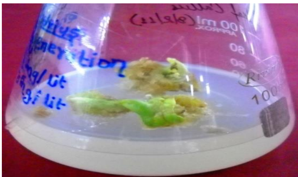
Fig. 3: Sub culturing of calli of leaf explants