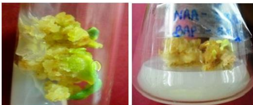
Fig. 4: Shoot Proliferation from cotyledonary leaves was visible after 28–31 days