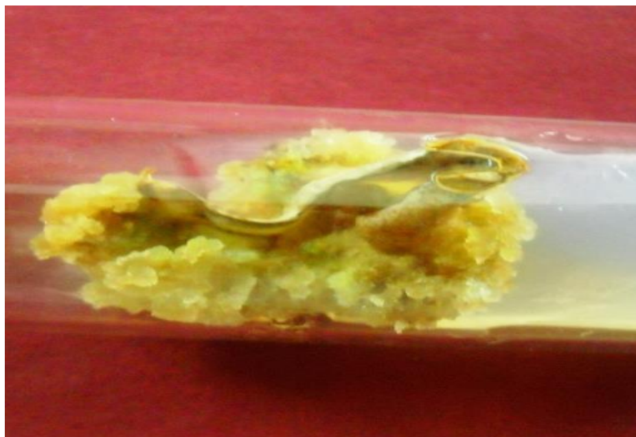
Fig. 2: Callus induction from first leaf (18–21 days after culture initiations)