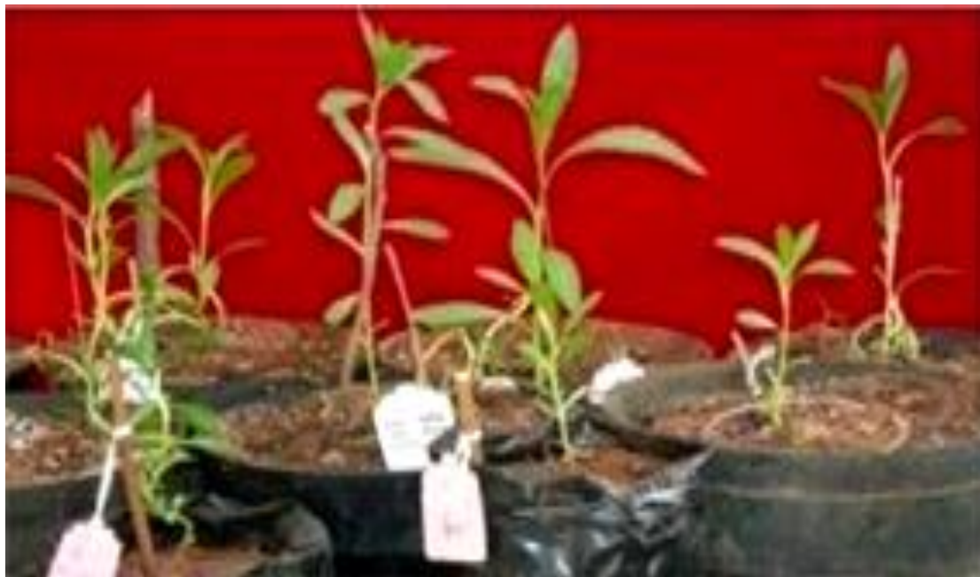
Fig. 6: Hardening acclimatized plant in the pot