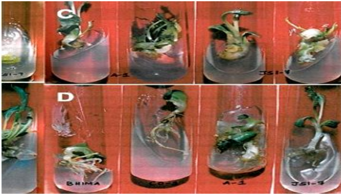
Fig. 5: Direct multiple shooting from First Leaf after 40–43 days after culture initiation