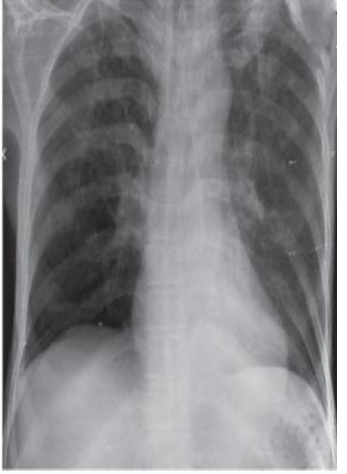
Fig. 2: X-ray report of TB patient before and after treatment