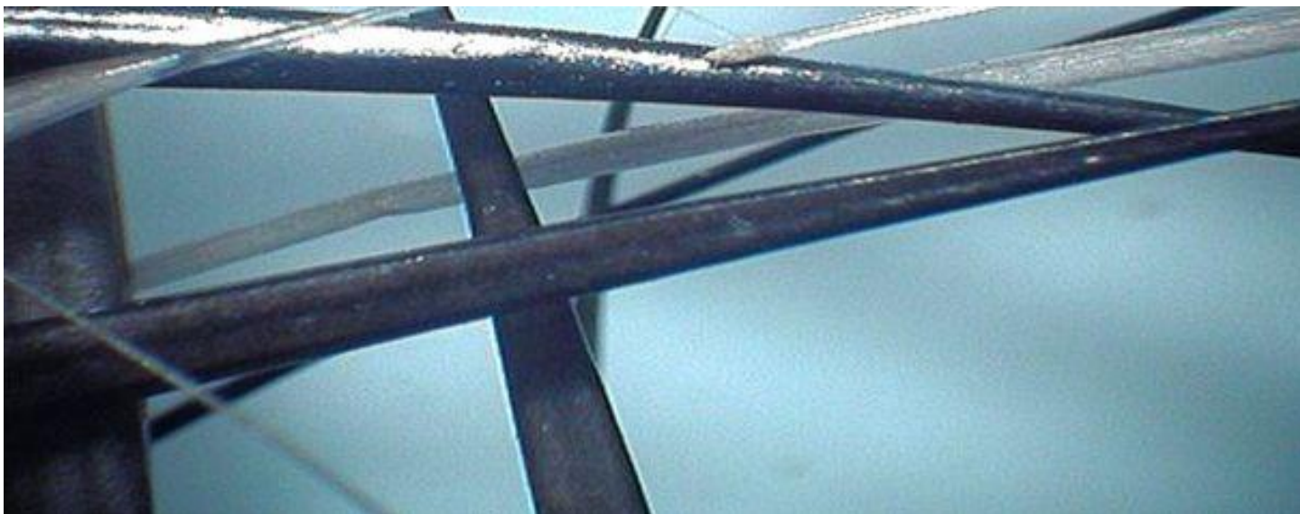
Bunch of Hair