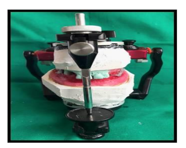
Fig. 3: Increased VDO

The anterior guidance disoccluded the posterior teeth in all jaw positions except centric relation. Occlusal overlay splint in the form of lower cd having monoplane occlusion opposing a removable partial denture in the maxillary posterior region was delivered and monitored for 1 month to evaluate patient's adaptation to the new VDO.