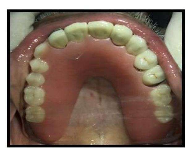
Fig. 7: Maxillary final prosthesis