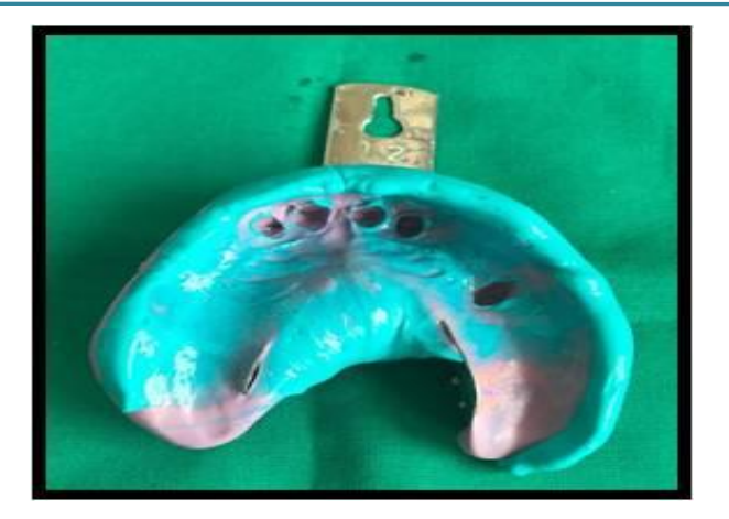
Fig. 5: Final impression