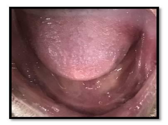
Fig. 2: Mandibular intraoral view patient and the options of treatment plan comprising of

seemed to be under strong tension. The patient did not have temporomandibular disorder history and soreness of the mastication muscles, but the discrepancy between centric occlusion (CO) and maximum intercuspal position (MIP) was found, when he was guided to CR with bimanual technique. The trans-cranial view was taken to determine whether a temporomandibular problem exists. The right mandibular condyle was flatter than the left one, but any specific disorder was not found.