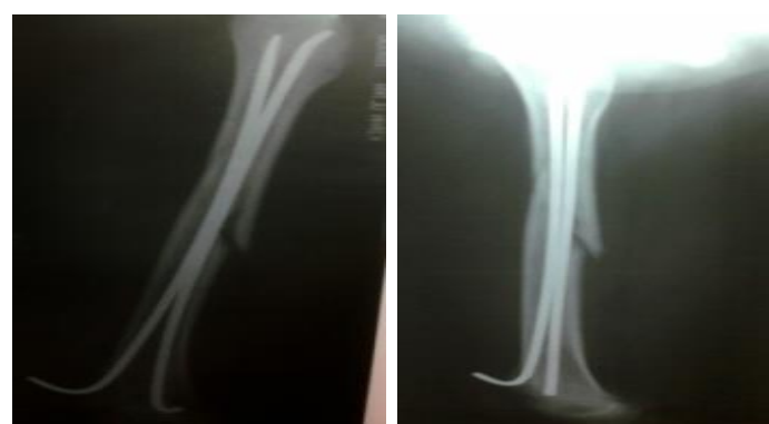
A (AP view)