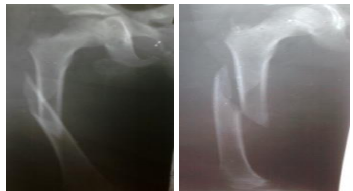
A (AP view)

Insertion of the later nail in a similar fashion but from the opposite side of the bone. All nails should be inserted up to the fracture site, the fracture reduced, and the nails tapped across the fracture site in an alternating manner for perhaps 1 to 2 cm into the far segment. All nails can then be knocked home, leaving sufficient nail exposed at the site of insertion to enable subsequent removal.