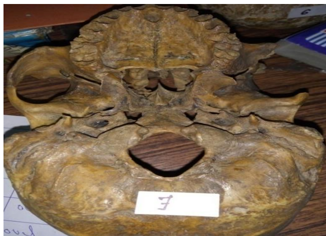
Fig. 3: Diamond shape of FM