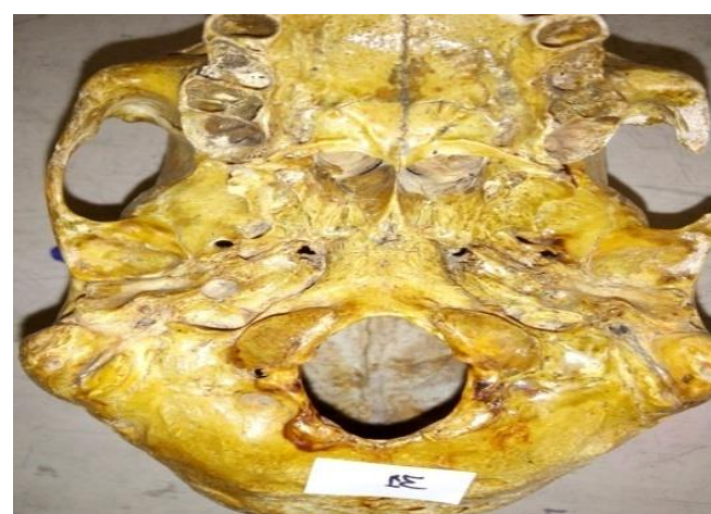
Fig. 6: Oval shape of FM

Variations in Shapes of foramen magnum – The frequency of distribution of various types of shapes were recorded. (Fig. 3 to Fig. 6).