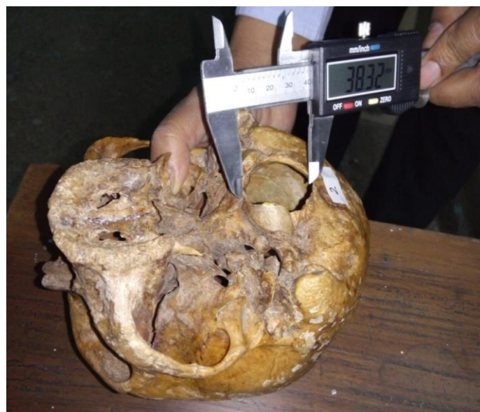
Fig. 1: Measurement of Antero posterior diameter

most prominent parts of the lateral curvature as straight transverse diameter (Fig. 2).