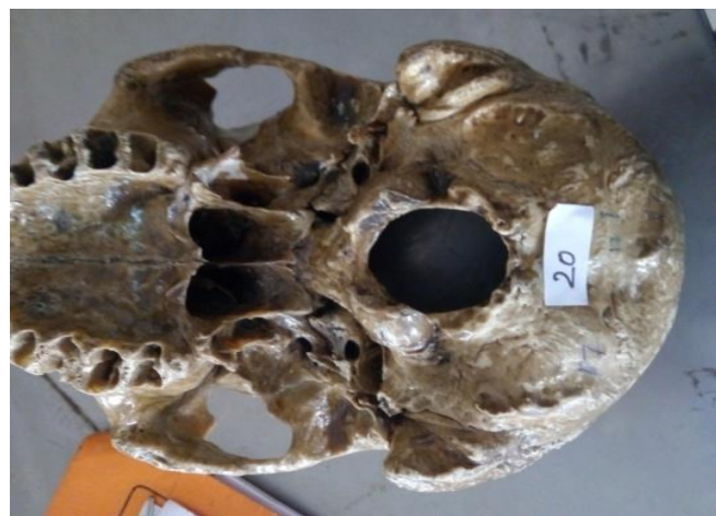
Fig. 4: Pentagonal shape of FM