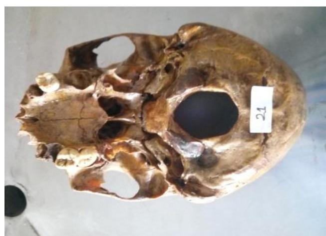
Fig. 5: Hexagonal shape of FM