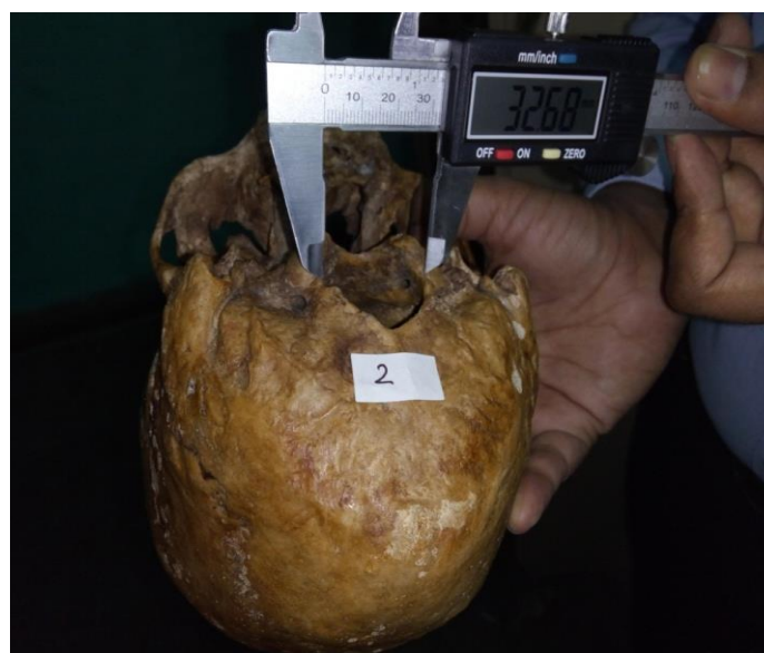
Fig. 2: Measurement of Transverse diameter

The two prongs of vernier calipers were fixed with screw over bony margins of foramen magnum then the length and width were recorded over the graduated metallic scale.